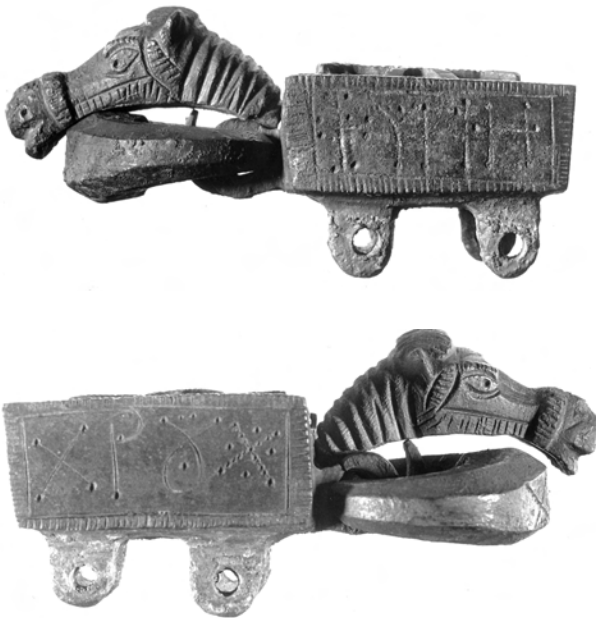
Cart Amulet, bronze, Early Christian/Byzantine. University of Toronto, Malcove Collection, M82.387, Cat. 107.

Reception, sponsored by the Hellenic Heritage Foundation Exhibition of Byzantine artifacts